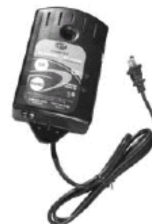
Alarm box for the pumping station